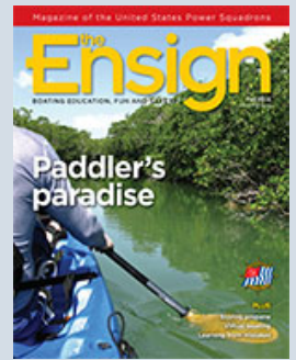
Ensign Fall 2014